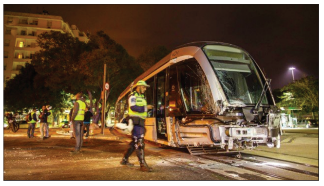
Figure 5: Collision between bus and Veículo Leve sobre Trilhos.

Nevertheless, accidents do happen. Almost 1 month after the inauguration, on July 27, 2016, at 9 PM, a VLT and a bus crashed each other, near Santos Dumont Airport, at Aterro do Flamengo, Center Rio,<sup>[14]</sup> as shown in Figure 5.