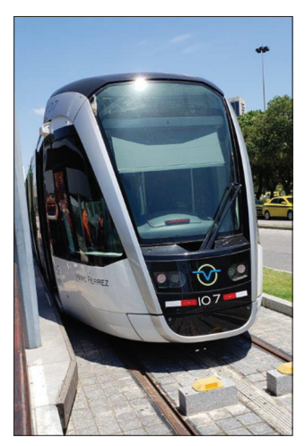
Figure 2: Alstom citadis 402.

The model adopted for the project was the Citadis 402 .<sup>[12]</sup> Each tram is 44-m long, 3.82 m height, 2.65m wide, with a nominal passenger capacity of 415 passengers, average speed of 15 km/h and maximum speed of 50 km/h, bi-directional with air conditioning system, working on a