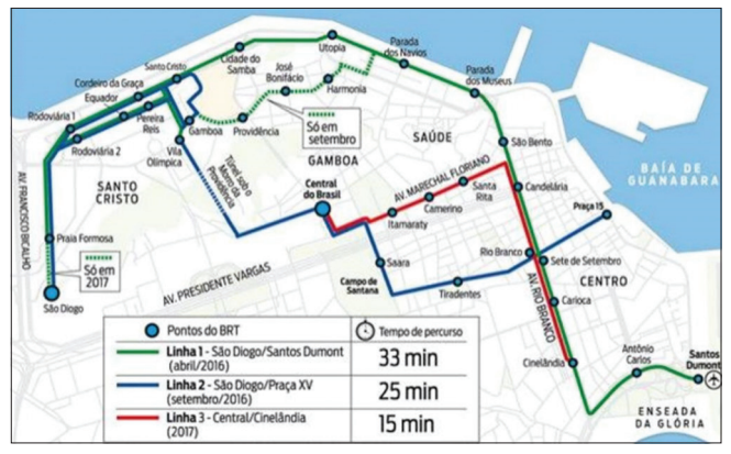
Figure 1: Veículo Leve sobre Trilhos carioca lines (VLT) 1, 2, and 3.

Line 1 was inaugurated for the Olympics on June 5, 2016, connecting Santos Dumont Airport to Novo Rio interstate bus station. It performs 6.4 km, with 20 stops, with access to subway lines 1 and 2, the Providencia cable car and the Padre Henrique Otte bus terminal, as well as the airport, the bus station, and the Pier Mauá cruise terminal.<sup>[3,4]</sup>