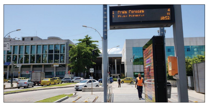
Figure 3: Santos dumont airport terminal. Airport at the bottom.

standard gauge (1445 mm gauge), and with eight doors on each side (16 in total). Alstom Citadis 402 is depicted in Figure 2, as follows: